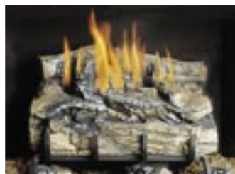
LOGF18 Log Set Gas Burner - GLVF24MAN