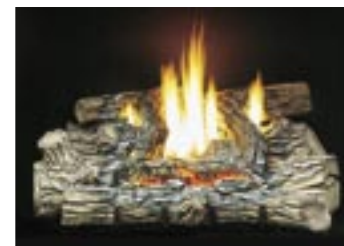
LOGF30 Log Set (available for ZVF52 model only) Gas Burner - GLVF24MVN