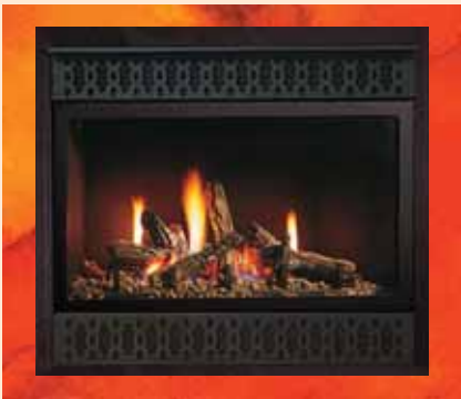
Unit illustrated is a ZDV3622N Zero Clearance Direct Vent Fireplace – Natural Gas, with LOGC50 Log Set, Z36PBL Decorative Black Panel Grill Kit.

LOGC50 Log Set – Seven Piece Classic Oak shown on the front of brochure.