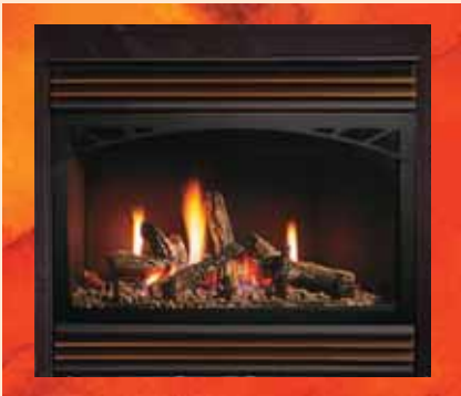
Unit illustrated is a ZDV3622 Zero Clearance Direct Vent Fireplace – Natural Gas, with LOGC50 Log Set, Z36GBP Grill Kit – Classic Polish Brass, Z36ADTH Designer Arch Door Top Half.