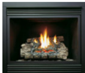
ZDV5245N Fireplace, Z52GBL Black Grills, LOGF30 Fibre Split Oak Log Set